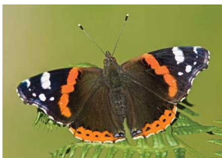
Red admiral