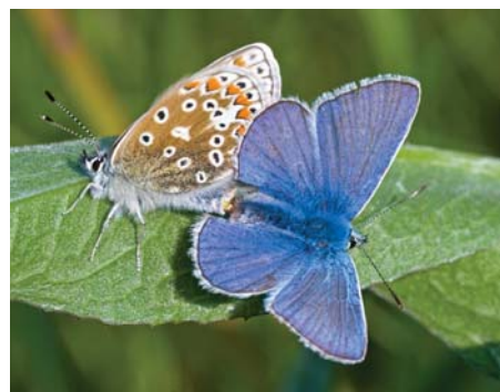
Common blue – John Bridges

Into high summer common grassland butterflies include small copper, common blue, meadow brown, large skipper, small skipper