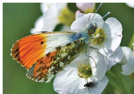
Orange-tip – John Bridges

Three nationally declining species, dingy skipper, small heath and wall can be seen regularly in our area. Dingy skipper can be found on sites with bird's-foot-trefoil and bare ground during May and early June, try Tunstall Hills and Fulwell Quarry. Small heath prefers sites with fine leaved grasses; again try our magnesian limestone sites. Wall loves to sunbathe and is found in sun-baked places with bare ground.