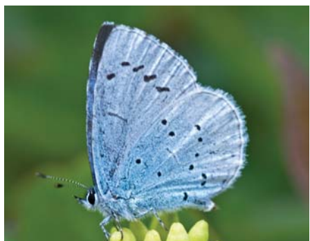
Holly blue – John Bridges

and ringlet. A summer woodland visit may be rewarded with a sighting of our two tree dwelling butterflies. Spotting white-letter hairstreak in elms and purple hairstreak in oaks requires patience, a keen eye and a pair of binoculars as they spend most of their time perched in the treetops. Look for trees on sunlit woodland edges. You should also be able to see second generation speckled woods and commas in July/August.