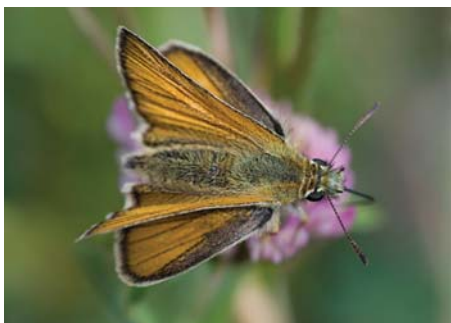
Small skipper