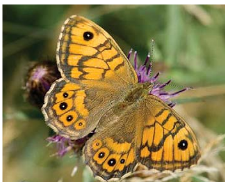
Wall – John Bridges

The bright orange wing tip markings of the male orange tip make it easy to spot as it searches for females from April until July. The female orange tip is more difficult to