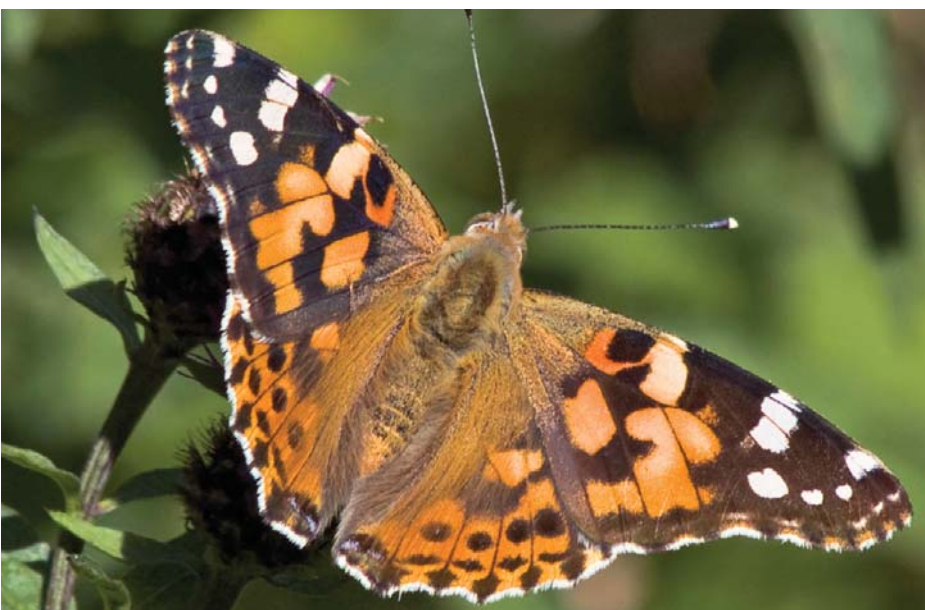
Painted lady