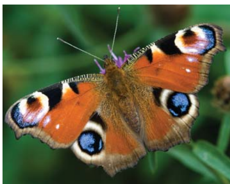
Peacock – John Bridges

The first flurry of butterflies can be seen as the weather warms in the spring and it is likely the first one you spot will be a peacock. This butterfly hibernates as an adult in sheds and woodpiles and is usually seen in February/March enjoying the warmth of an early sunny day. Milder, warmer winters have resulted in sightings of peacocks from as early as January. Other hibernating butterflies, small tortoiseshell and red admiral, closely follow the appearance of the peacock.