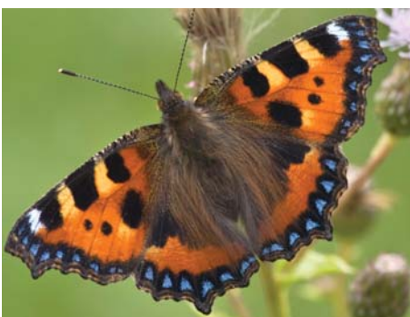
Small tortoiseshell